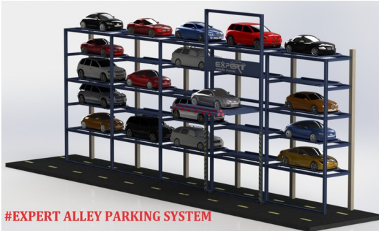
#EXPERT ALLEY PARKING SYSTEM